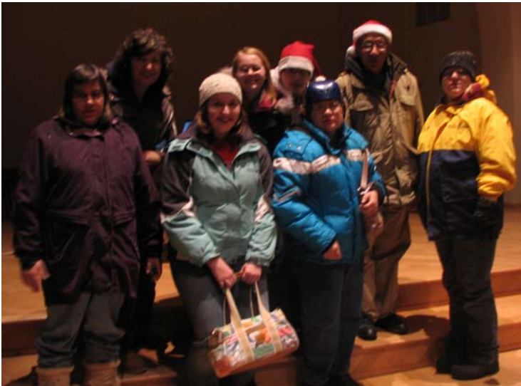
Supported Living took the opportunity to have a group picture taken— here are some staff and people supported from Supported Living that came to the party!