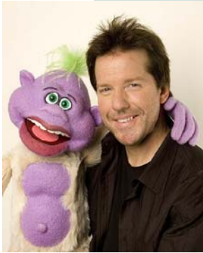
Bottom: Jeff Dunham and Peanut